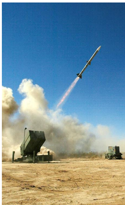
Excellent performance in time critical fire support applications