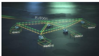
Advanced network functionality

Land Systems deliver world class robust and network centric communications solutions and precision engagements with maximum effect and protection. All products in the K-TaCS family are high quality ruggedized-by-design equipment for use in advanced military tactical communication systems.