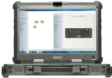
The versatile Communication Management System simplifies the task of configuring your units with an intuitive graphical presentation

The student audience for the Communication Network Administrator Course are communication network administrators and other personnel with overall technical communication responsibility as their primary task in their unit. Personnel attending have completed operator or maintenance training in advance. This precondition must be fulfilled in order to possess the knowledge needed in order to be able to follow the course progress.