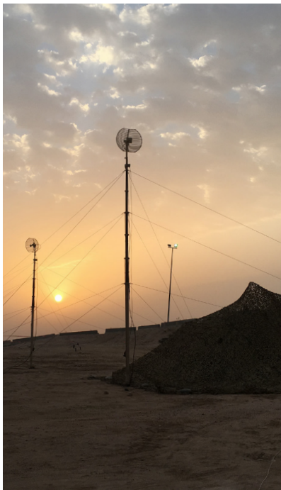
Large communication systems demand a robust and user friendly management. The role of the network administrator is crucial for mission success and equipment availability