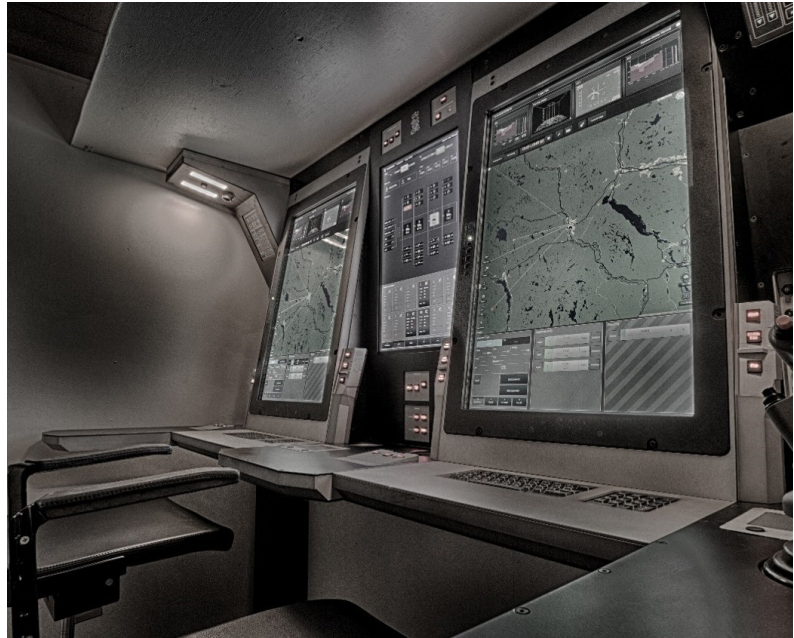
MLT600 used in the advanced KONGSBERG Raytheon NASAMS Air Defence System