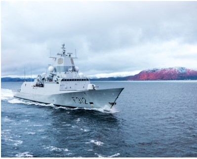
Application on Naval Systems