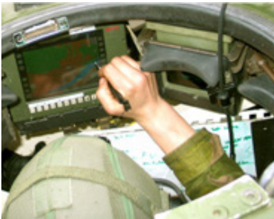
Application on C5I Systems