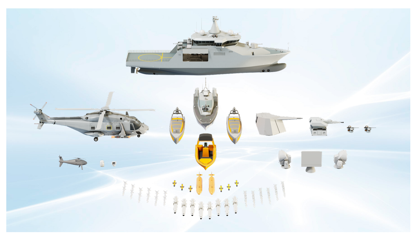
Sense - Decide - Act