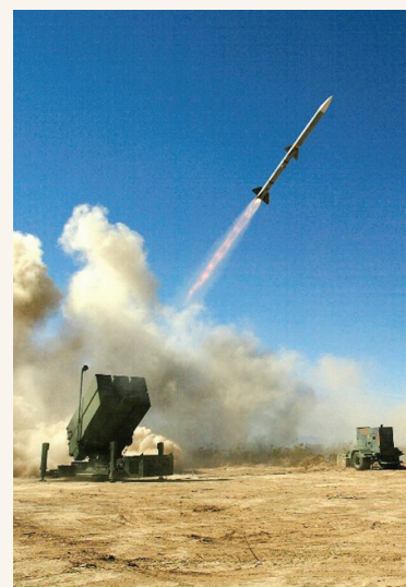
Excellent performance in time critical fire support applications