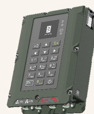
THOR Radio Control Terminal