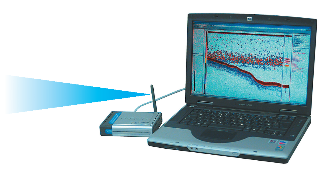
The EK60 is here shown with a D-link communication using off-the-shelf computer hardware. The range is approximately 1000 meters using the equipment shown, but this can be extended using directional antennas.