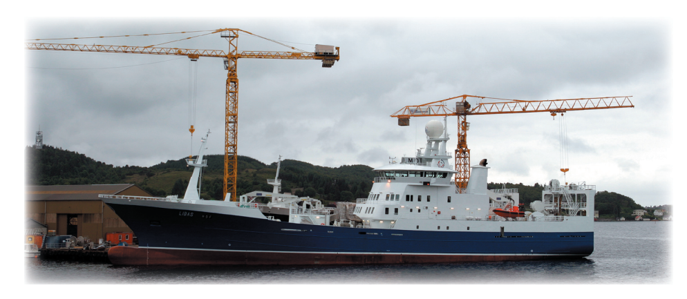
F/V Libas is a modern Norwegian fishing vessel equipped with a six-frequency EK60 system as well as SP70 and SH80 sonars. All systems collect data for the Institute of Marine Research in Bergen, Norway.

A recent trend among Marine Institutes is to establish a reference fleet of commercial fishing vessels to collect scientific data. EK60 echo sounders onboard fishing vessels are remotely operated via satellite link from the respective research institutes, where the scientist can take full control of all echo sounder functions.