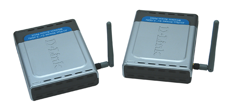
A simple and low-cost solution for short range wireless echo sounder control is to use a pair of WLAN transmitters.

The echo sounder system consists of the transducer, the General Purpose Transceiver (GPT) and the Processor Unit (PC). Wireless communication can be introduced between the GPT and the PC, and/or between PC and PC. There is a trade-off between range and data transmit capacity of the link. You have many technologies to choose from.