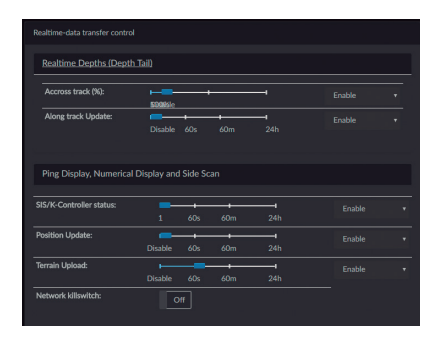
SIS Remote can be configured to transmit more or less data depending on the bandwidth available