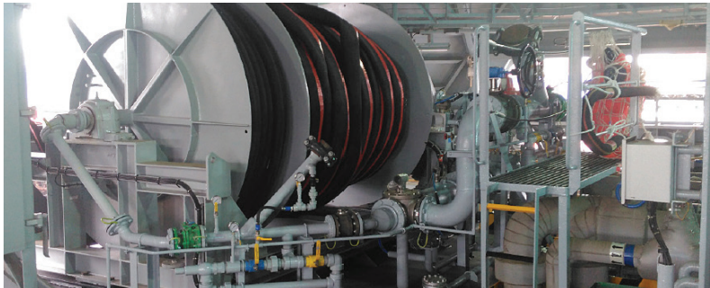
Astern reel pig launcher