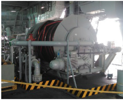
Astern reel main drive motor