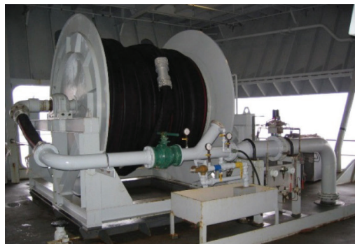
Typical single 6" hose diesel astern reel

A manually controlled oscillating hose spooling carriage is fitted to ensure that the hoses are paid out and recovered smoothly and without damage. The hose carriage is driven mechanically by a separate motor. Only one of the two hoses may be deployed at a time so the spooling carriage can be used on any of the hoses fitted to the drum. An associated electrical starter panel is also supplied which is mounted in an enclosed compartment position.