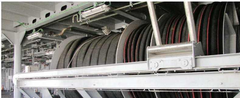
Astern reel spooling gear