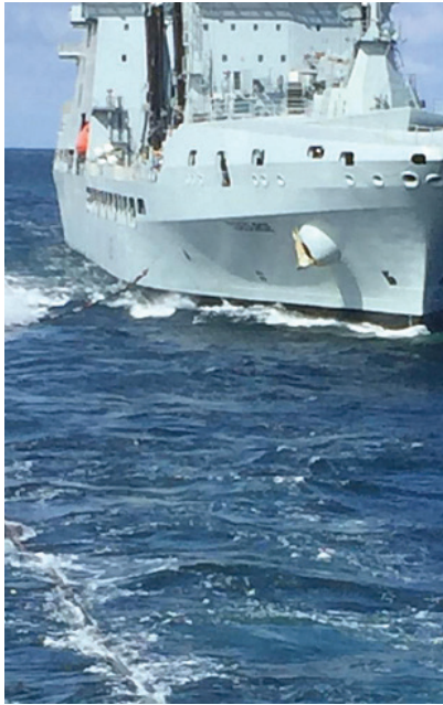
Astern reel operations at sea