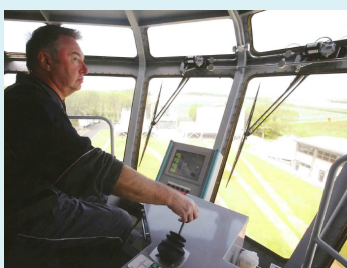
HRAS Operator Console Desk