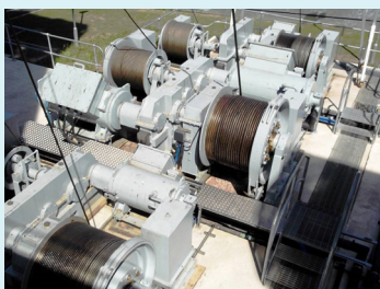
HRAS Winch Deck