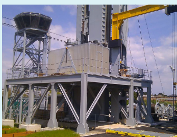
HRAS Delivery Platform and RAS Mast at HMS Raleigh