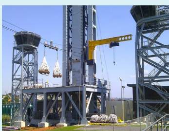
HRAS Transfer of NATO Netted Load Pallets

The HRAS system comprises of a single heavy Jackstay wire which is held in constant tension to support the weight of the load. The load rolls over the Jackstay wire running on a two sheave traveller assembly which is pulled in either direction by the Inhaul and Outhaul wires. The traveller assembly has been specially designed to keep the profile of the projecting steel wire ropes as low as possible when it enters the RAS reception area inside the receiving vessel RAS pocket. Mathematical simulation and land based trials were used to confirm the stability of the traveller assembly load while the vessels are subject to sea state 5 ship motion displacements, both as the load transits across the span and as it enters and exits the restricted space inside the hanger deck area.