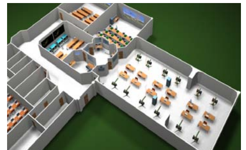
Complete Air Defence Training Centre