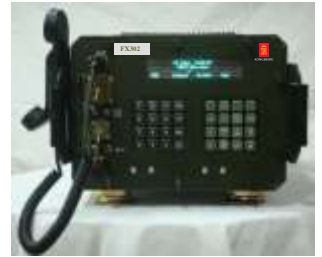
• FX301/FX302 – Field Exchange with 10 or 20 lines