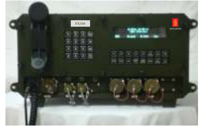
• FX304/FX310 – Field Exchange with 40 or 100 lines