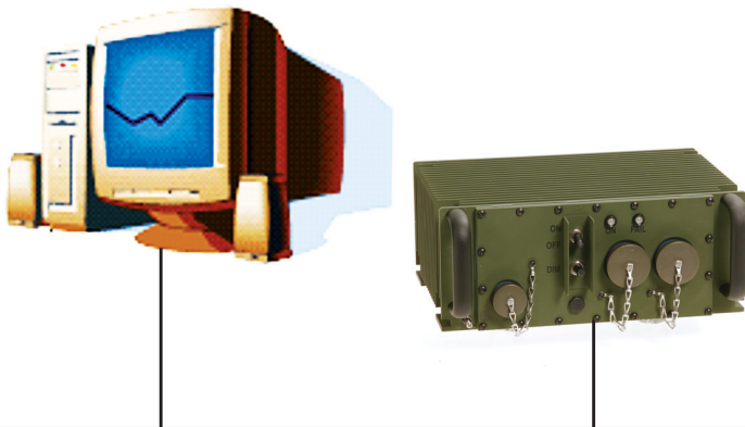
COMPAS BUS DDS

COMPAS BUS is compliant with the Data Distribution Service (DDS) specification which standardizes the software application programming interface (API) by which a distributed application can use "Data-Centric Publish-Subscribe" (DCPS) as a communication mechanism. The DDS specification is governed by the Object Management Group (OMG).