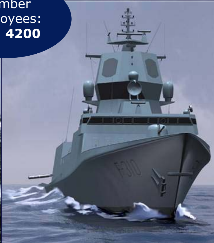
Kongsberg Defence & Aerospace