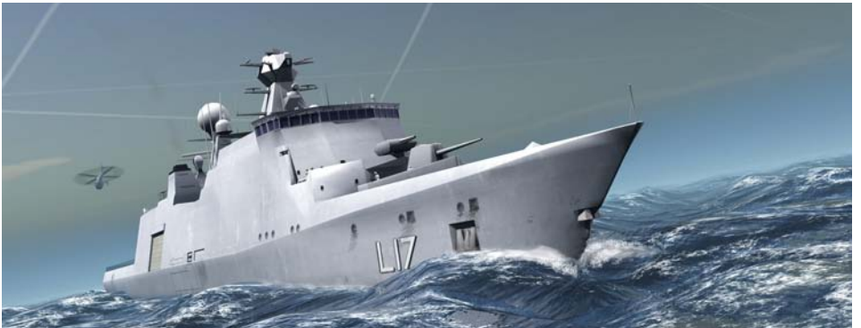
Water simulation and individual 3D models