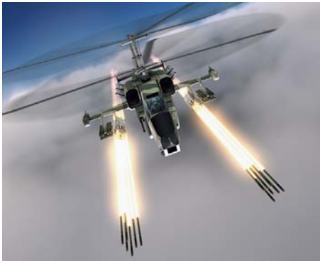
3D models with special effects