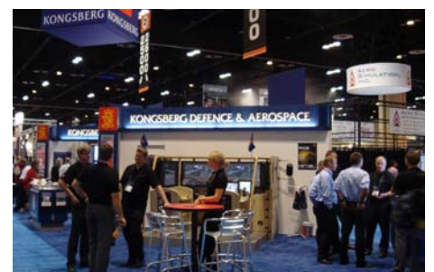
From I/ITSEC 2009 in Orlando, Florida