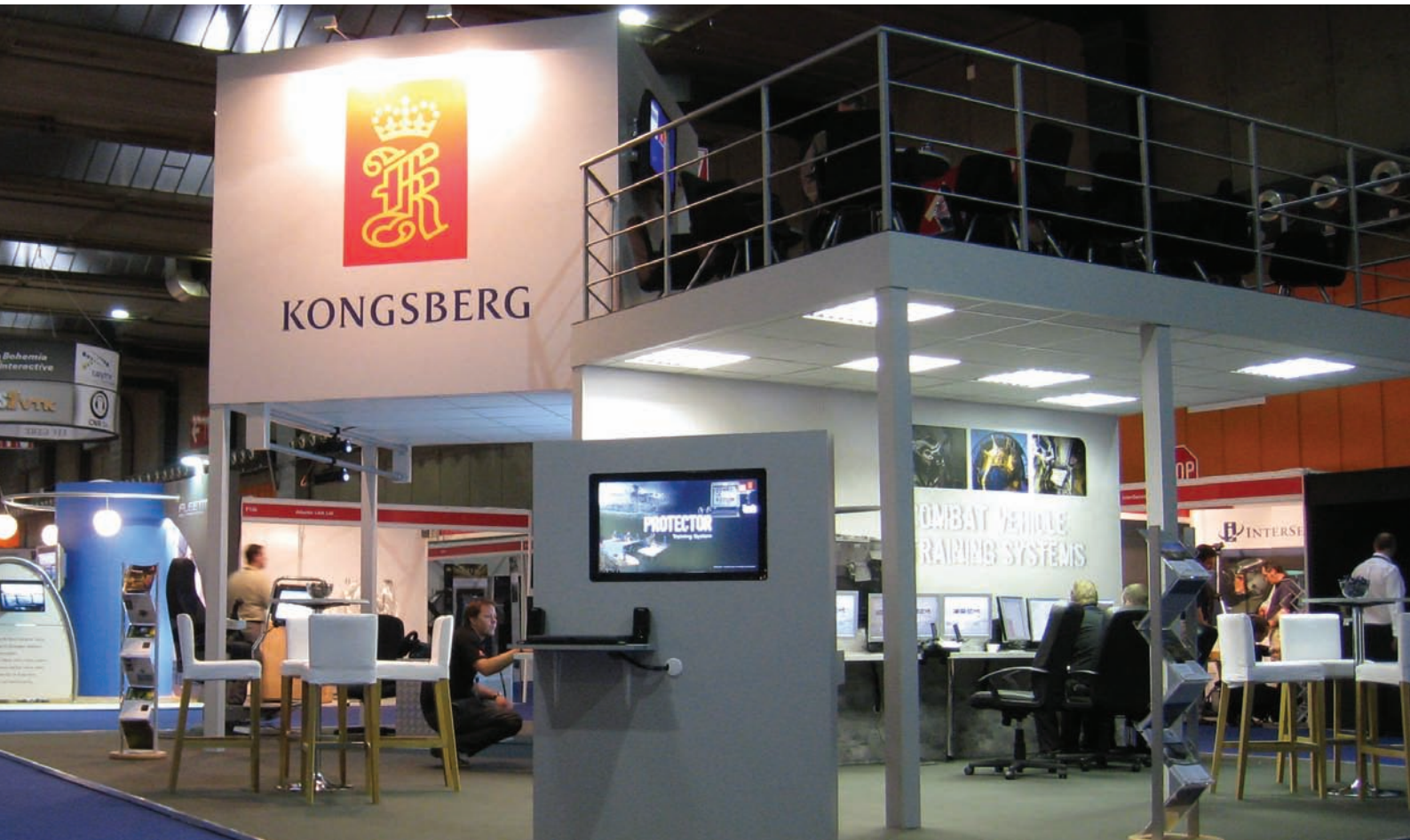
From ITEC 2009 in Brussels

Simulation & Training (S&T) will be attending several events in Europe and in the US this year. We're starting with AUSA Winter Symposium & Exposition in Fort Lauderdale, Florida 24-26 February. The Winter Symposium and Exposition is a meeting place for all AUSA members, employees or consultants of AUSA Member companies, military and civilian government personnel, invited guests, and non-members that are interested or have an identifiable relationship with AUSA or the United States Army.