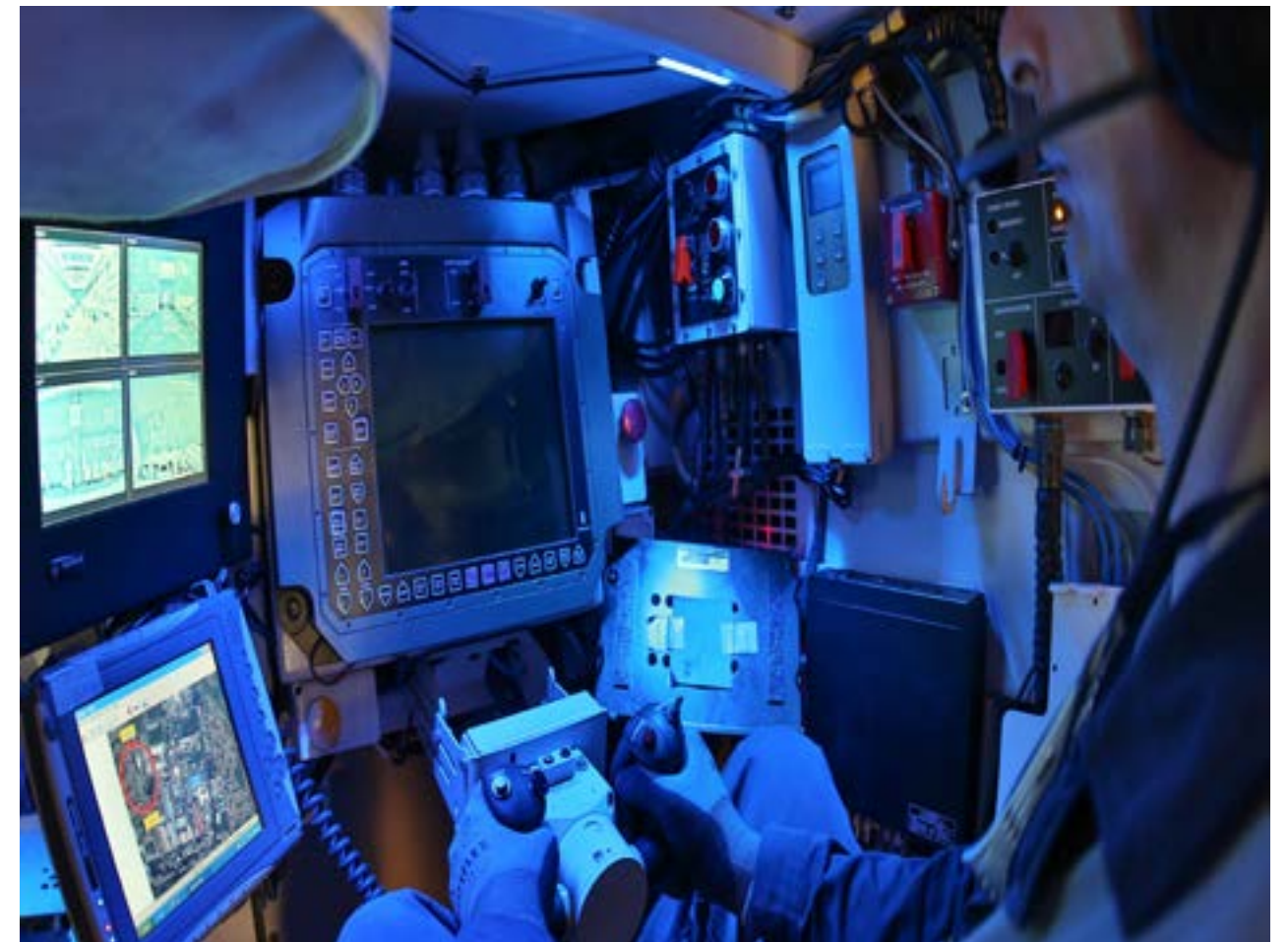
TURN-KEY COMMUNICATIONS SYSTEMS

We believe that in the dynamic realm of modern warfare, victory is determined not just by the strength of weapons, but by the efficiency and reliability of C5IS systems.