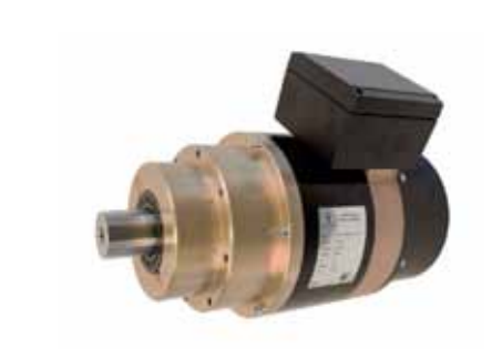
SEFA 160 / 800