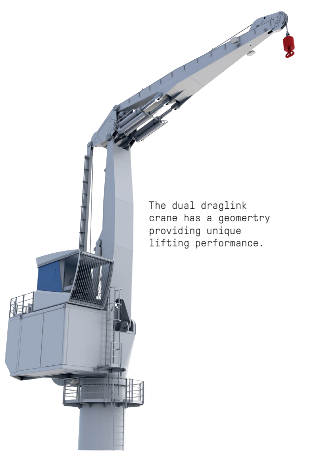
KONGSBERG SUBSEA CRANES