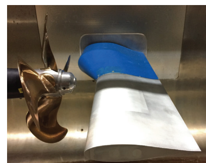
Conventional off-centre rudder