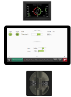
Bridge components: Display, indicator and input device

The system has an interface to ship-wide data logging, and is prepared for Remote Access for remote inspection and fault finding (will need separate hardware).