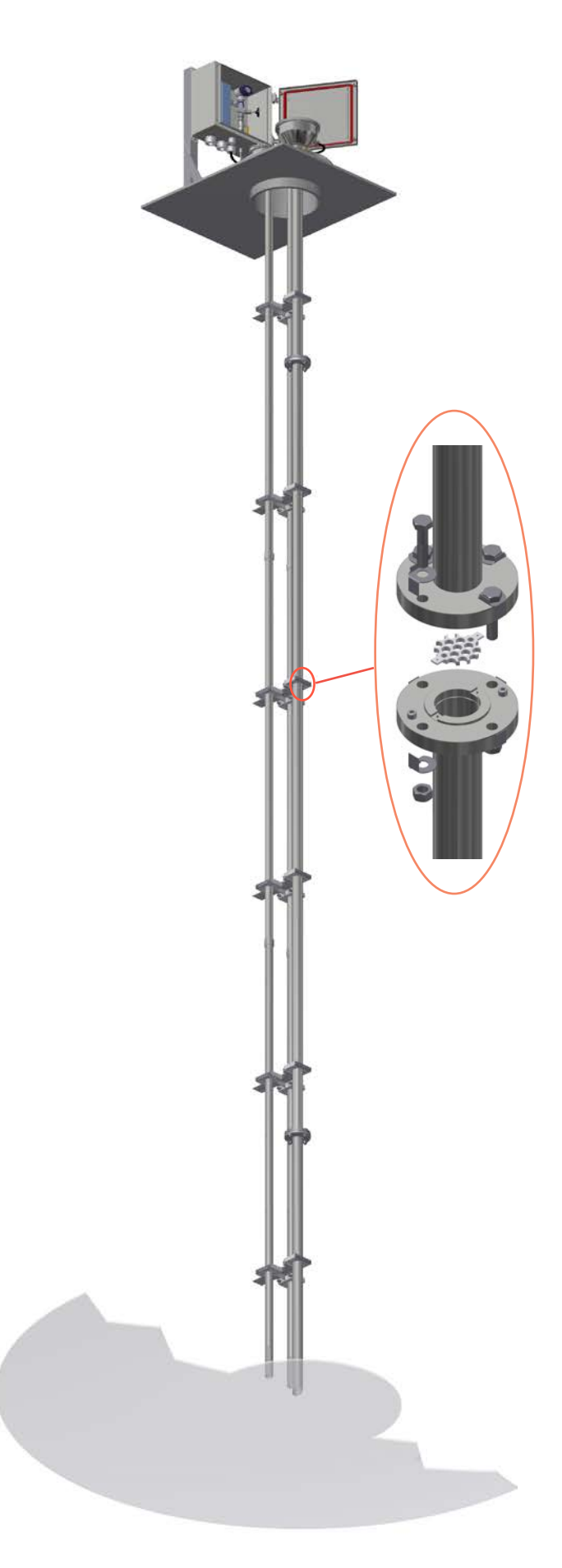
Figure 7: Standpipe installation with marker for auto-calibration by AutroCAL<sup>®</sup> (example)