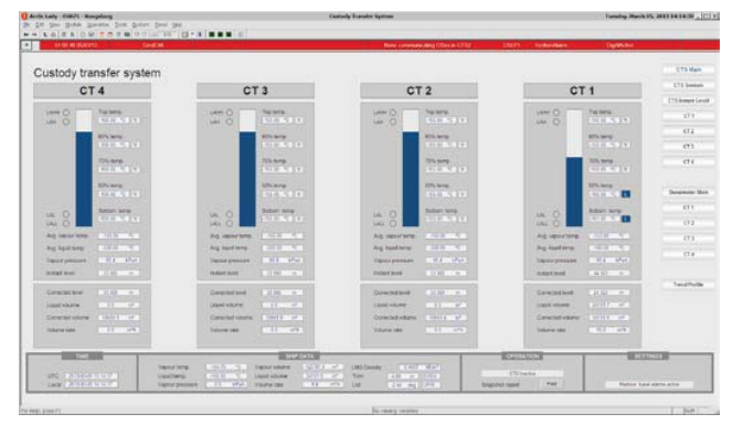
Figure 8: CTS overview mimic picture (example)