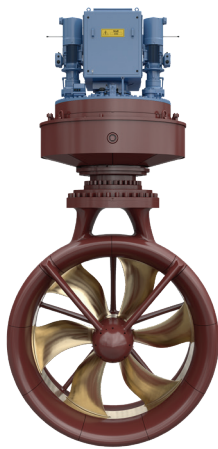
Rim Drive Azimuth Thruster, front