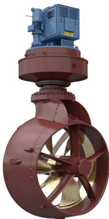
Rim Drive Azimuth Thruster, aft side