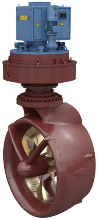
Rim Drive Azimuth Thruster, front left